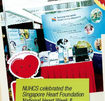
NUHCS celebrated the Singapore Heart Foundation National Heart Week & World Heart Day 2013 on 28-29 September 2013 at Toa Payoh HDB Hub Mall with the largest Singapore map made up of little red acrylic hearts!