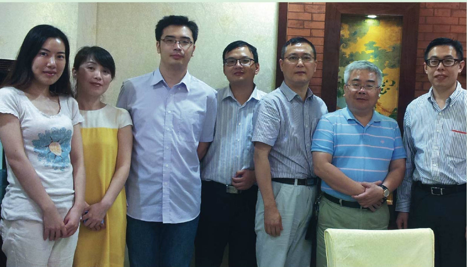
Meeting between the Sleep and Stent Study Data Management Team and co-investigators from the Shanghai Chest Hospital in September 2013.

Since the 1980s, OSA has been well recognised in the Western countries. In Singapore, the first household survey was conducted in the 1990s. Symptoms of snoring and sleep disturbances, hypertension, weight and height, as well as objective measurement of neck circumference were recorded. The minimum whole population prevalence of OSA, defined by a diagnostic triad of symptoms, neck circumference and witnessed apnoea/hypertension, was 0.43%, nearly 22,000 of the population. Epidemiological evidence indicates that the prevalence of OSA is greater in patients with coronary artery disease than in the general population. Using the Berlin Questionnaire, our group has identified that 44% of the hospitalised cardiac patients are at high-risk for OSA. Furthermore, we reported that